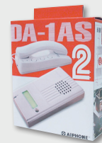
DA-1AS Single Tenant Box Set